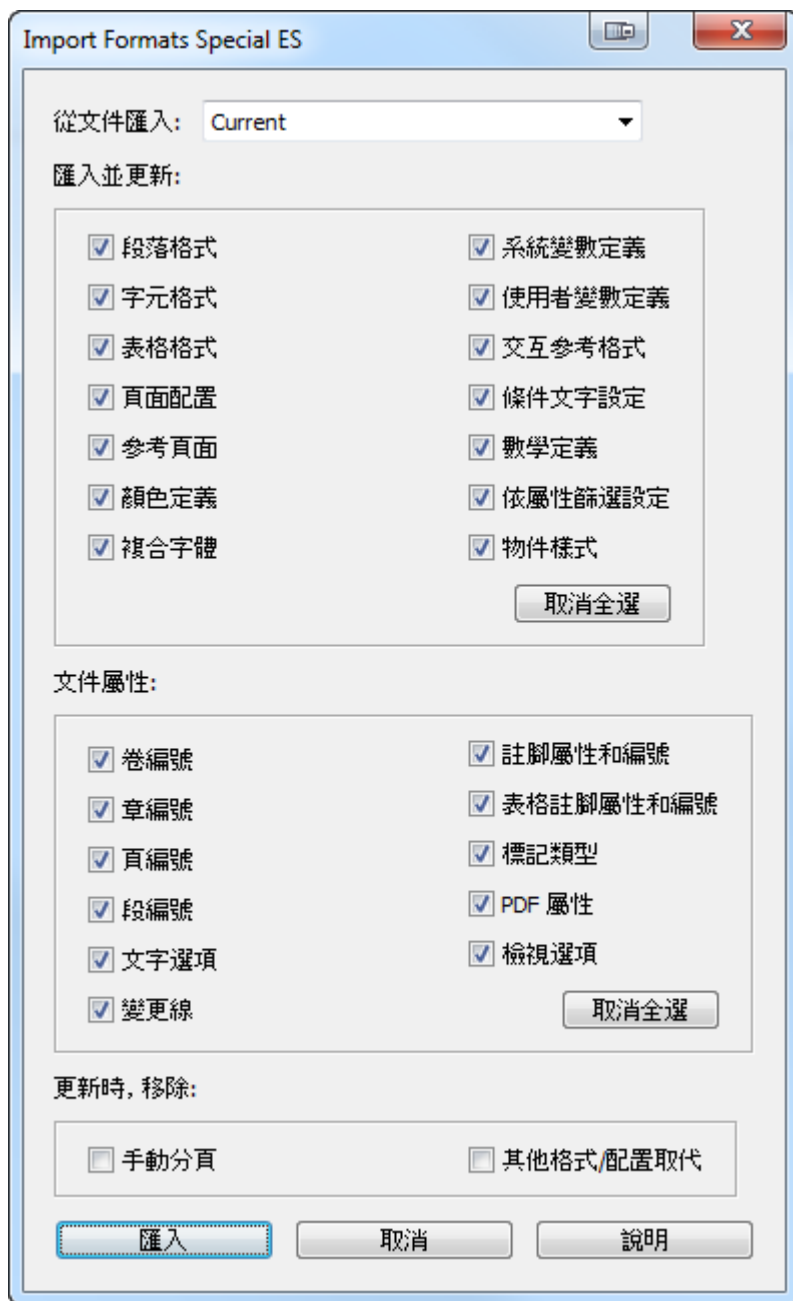
ImportFormatsSpecial ES dialog box localized for Chinese.